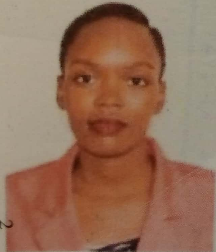
Signature of Registrar of Seafarers: